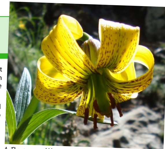
A Pyrenean lily - the flora of the area is superb

The sheer cliffs of the Valle de Ordesa are an undisputable highlight of the Pyrenees. As you follow the Río Arazas you'll pass waterfalls and rock pools before the woodland gives way to spectacular views of the surrounding cliffs and the 3000m peak of Monte Perdido towering above you.