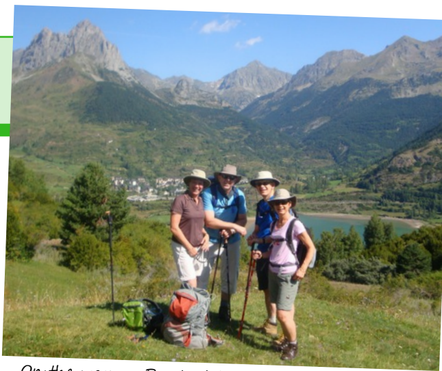
On the way up Punta del Pacino

Prices are based on two sharing a double or twin room and do not include flights. Wine is not included with the evening meal.