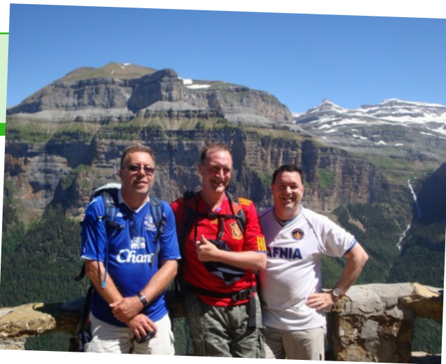
Views from the Faja de Pelay