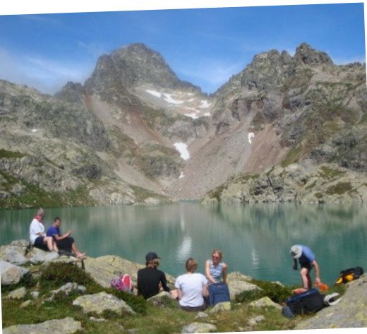
Lunching at Ibon de Arriél

However we remember you are on holiday and one or two days will feature slightly less strenuous hikes. Paths are generally good but there will be some exposed sections and some easy scrambling and sure-footedness is required. You should expect days of between seven to ten hours walking.