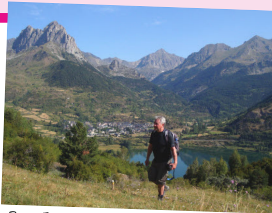
Pena Forata above Sallent de Gallego

Prices are based on two sharing a double room. Prices do not include flights. * Transfers are on Sunday evenings to meet the Ryan Air flight from Stansted.