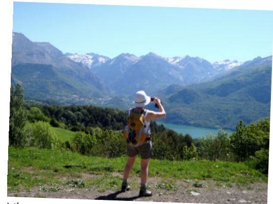
Views across the Valle de Tena

For the full board option a picnic lunch is provided for you to eat on the trail. Three course evening meals are taken at the hotel restaurant each evening.