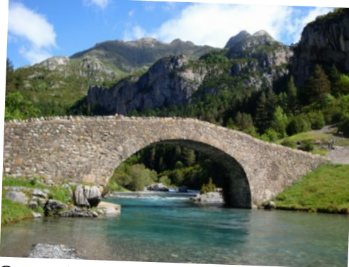
Roman bridge at Bujaruelo

The pretty village of Torla has a range of shops, bars and all of the amenities you'll need and is less than 15 minutes walk away.