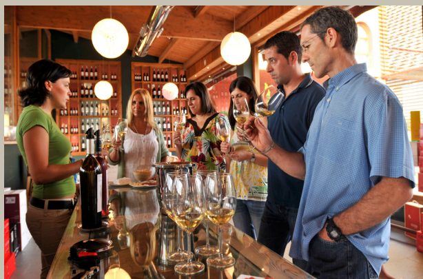
There are vineyards to visit throughout Aragon.

The designation of de la Tierra has been created to identify a series of wines from particular areas, which have pleasant surprises in store for the consumer.