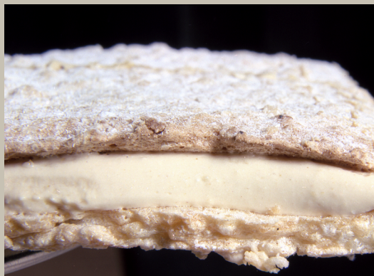
Huesca's famous pastel ruso.

Although many of these products originate from a particular area, they are available in other localities in Aragon, above all in the city of Zaragoza.