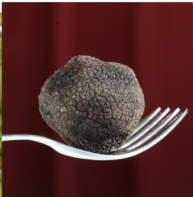
Black truffles from Graus and Sarrión.

A VARIETY OF PRODUCTS ARE TAKEN TO THEIR CULINARY HEIGHTS IN ARAGON. FIND OUT ABOUT THEM AND, IF YOU GET THE CHANCE, TRY THEM.