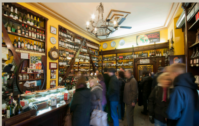
Traditional wine shop in the historic quarter.