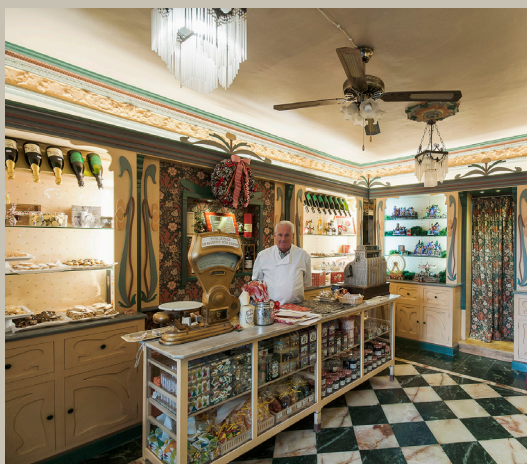
Traditional confectionery shop in Jaca.