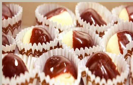
Huesca's traditional castañas de mazapán.