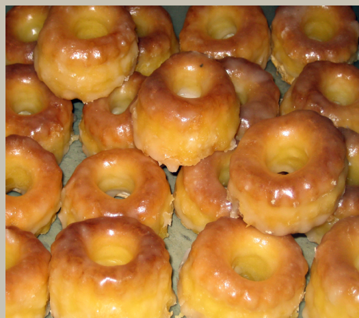
Glorias de yema.